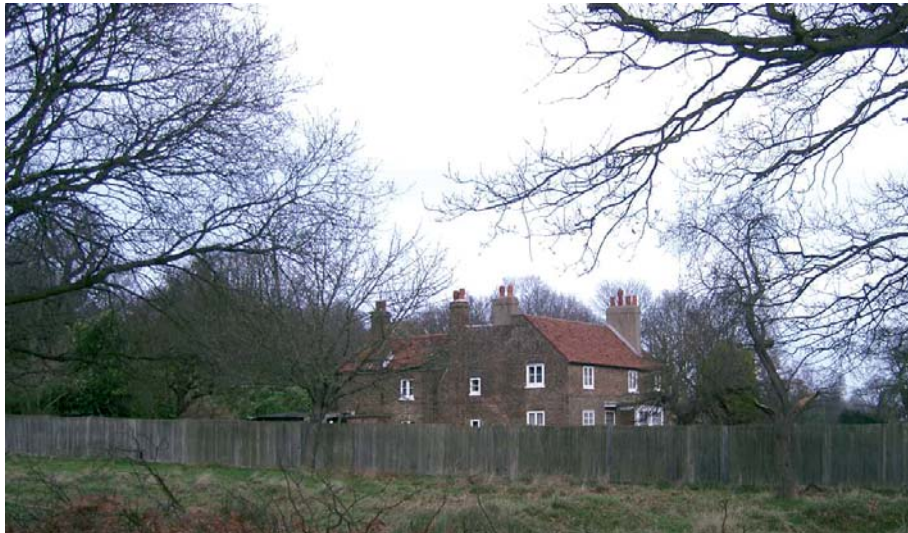
White Ash Lodge today