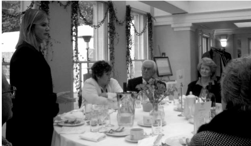
Justine Greening MP speaking, with Friends' Patron Lord Rix listening in the background