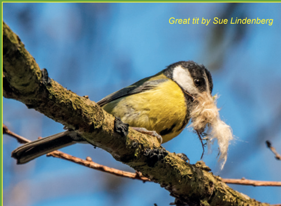
Great tit

Richmond Park is a National Nature Reserve, a Site of Special Scientific Interest and a Special Area of Conservation