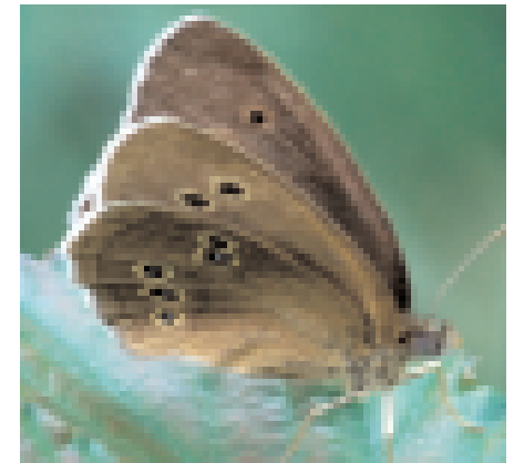
Female Ringlet – underside