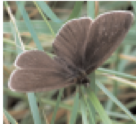
Male Ringlet – top-side

Whereas the Meadow Brown can often be seen in abundance on a hot summer day flying in the open grassland, the Ringlet prefers the shade and dampness of well-protected and watered woodland edge. Unlike most of the other Satyridae , these butterflies seem to flourish in a rainy summer and are even happy to be out and about in the rain while other butterflies are clinging with closed wings to strong grass-stems.