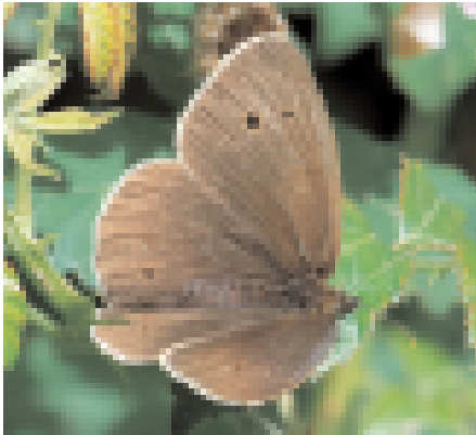
Female Ringlet – top-side