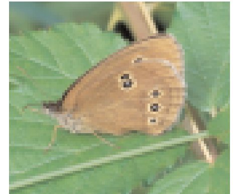
Male Ringlet – underside

If you find any in the Park, please record the date, numbers and location of these and let us have a note of this on one of the "occasional recording forms" available at Holly Lodge or at the Pembroke Lodge Information Centre. Good Hunting!