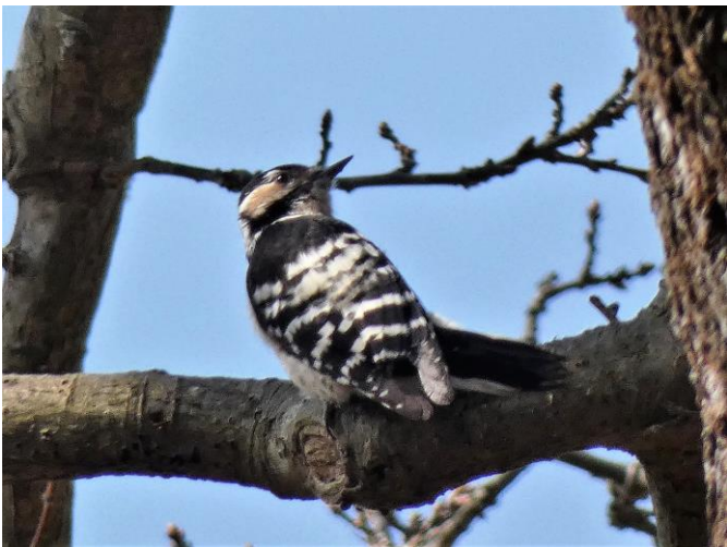
f. Lesser Spotted Woodpecker