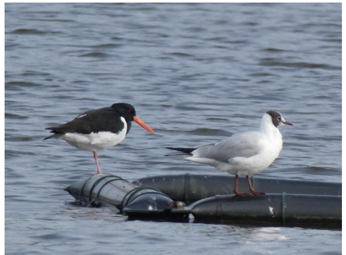
Oystercatcher with Black-headed Gull