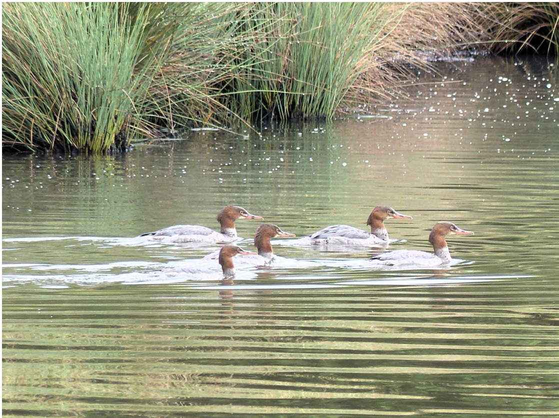
Five juvenile Goosander at Upper Pen Pond

A summary of ten years of records by The Richmond Park Bird Group