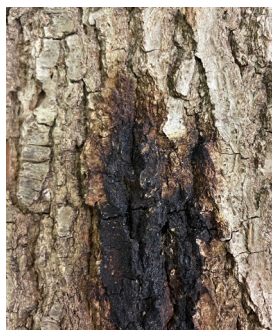
Stem bleed in the tree's bark

The research has found that the impacts of climate change (particularly drought), compaction and poor soil quality are key