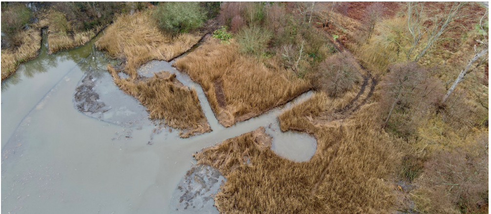
Photo of the reed bed extension in Pen Ponds