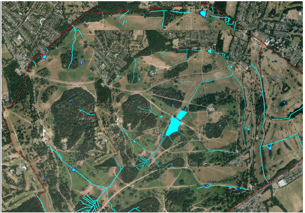
The northern part of Richmond Park showing its ponds, streams and ditches

and dry in summer. Its main rival is the ephemeral pond near Roehampton Gate, which for many years appeared after heavy rain and then disappeared again. Improvements to the drainage of the surrounding land into Beverley Brook has now disappeared it entirely.