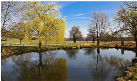
Martin's Pond, one of Ron's favourites

By far the largest are Pen Ponds (Upper and Lower). Originally a trench dug to drain the boggy land to the west,