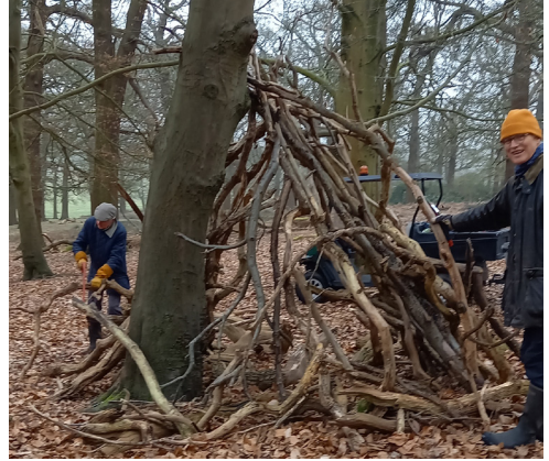
Deconstructing a den

It's not only woodlice, centipedes and beetles which benefit when wood is left to rot on the ground. As fallen wood rots and breaks down, its nutrients are