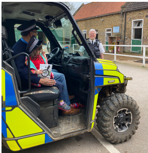
The Parks Police taking part in a Discoverers Day event at Holly Lodge last year

Photo of the gatekeeper at Kingston Gate is from a postcard in the Hearsum Collection, probably from 1913.