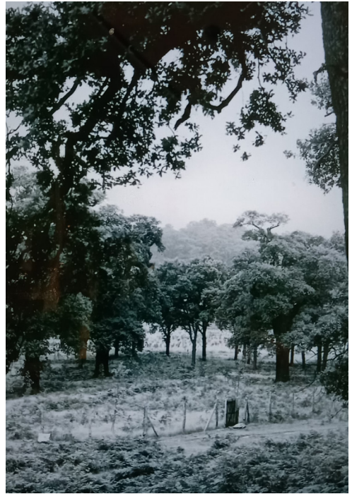
Prince Charles Spinney in 1949 before its enclosure

Future maintenance will be needed as both birch and bramble are vigorous and will regrow. There is also some bracken to be controlled. Coppicing of the hazel on a rotational basis will provide hazel sticks for use in the park. This and maintenance will be future jobs for the conservation volunteers!