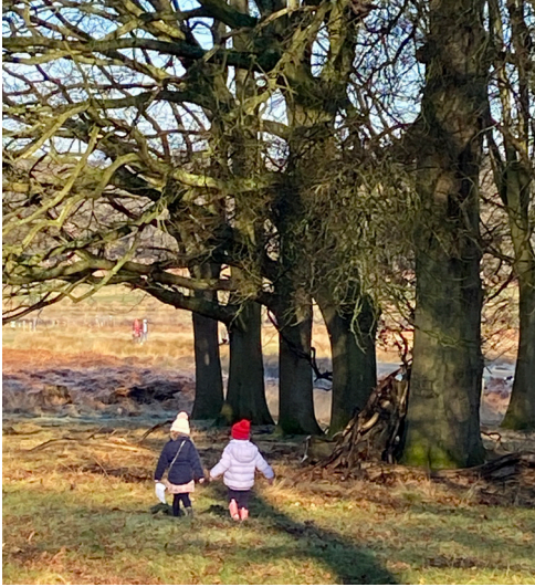
We're going on a treasure hunt...

W inter is a good time to focus on birds since there are no leaves on the trees so they are more visible. With education in mind, we decided to look at feathers, how specialised they can be (e.g. for warmth, for flight, for display) and how good they are at keeping birds warm in winter.