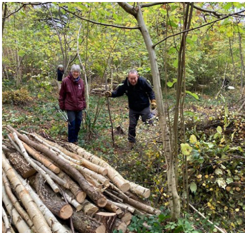
Friends conservation volunteers working in the Spinney last winter

Bluebells were appearing in February and should now be visible when they bloom through the fence along the north side of the spinney.