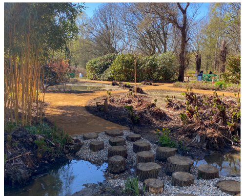
The restored stepping stones