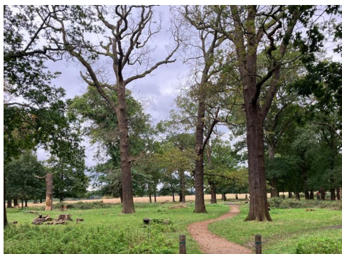
Photo shows Sheen Wood whose oaks have been badly affected by AOD