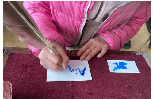
Writing with a quill - how did Shakespeare do it?

We looked at feathers through our new portable microscope. It has no eye piece but a mini screen instead so it is much easier for children to use, without losing the wow factor. Viewing the world of the invisible with the naked eye is always amazing for children and adults alike.